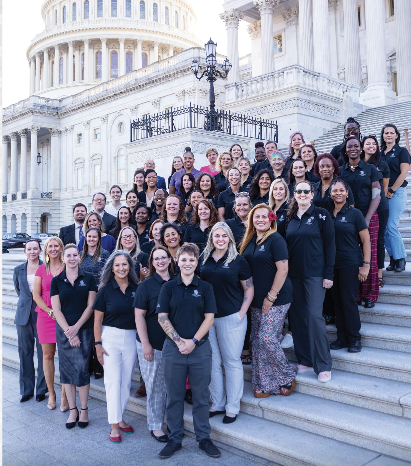
WWP WOMEN WARRIORS JOIN TOGETHER TO ADVOCATE AT THE 2023 WOMEN WARRIORS SUMMIT IN DC

The summit also featured presentations by Department of Veteran Affairs staff on critical programs, meetings with members of Congress and their staffs, a roundtable discussion with the Congressional Women Veterans Task Force, and discussions with White House staff on veterans issues.