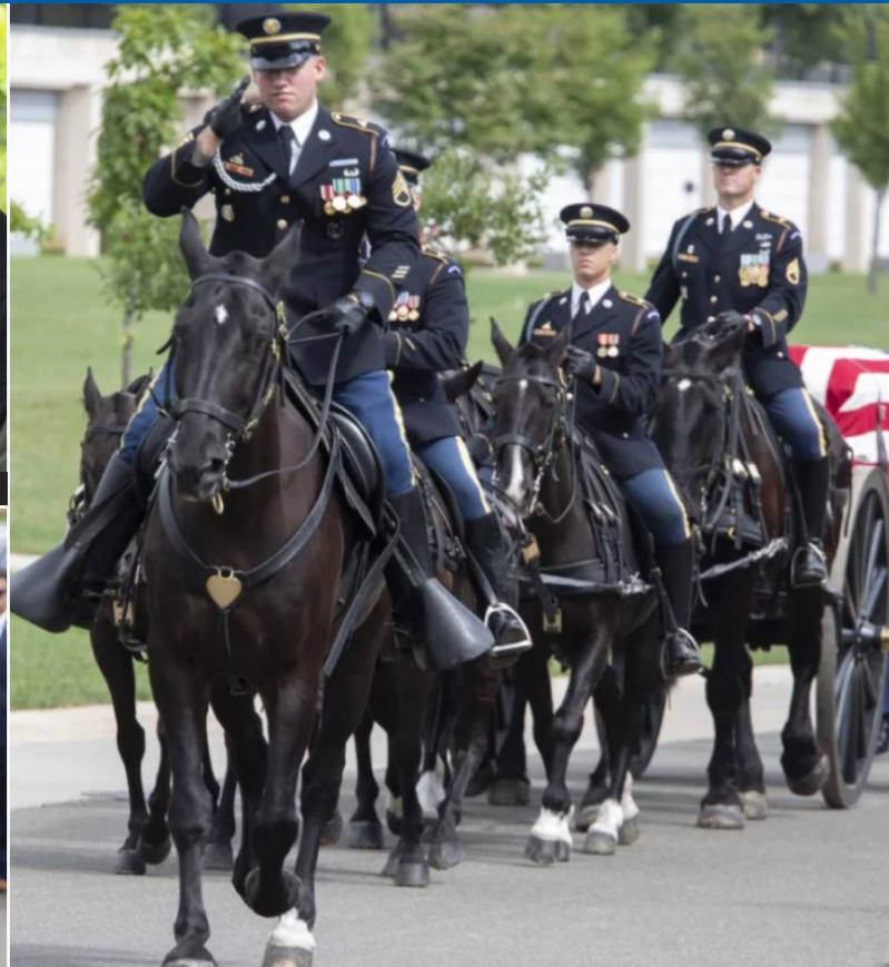
Major Star is interned at Arlington National Cemetery