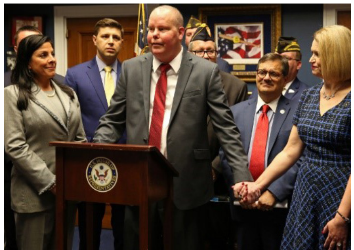
Major Star advocates for legislation to approve concurrent receipt of DoD retirement pay and VA disability compensation