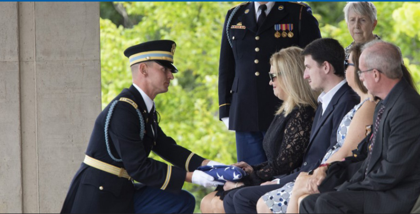
Major Star's widow, Tonya, receives a folded flag during a September 13 internment ceremony