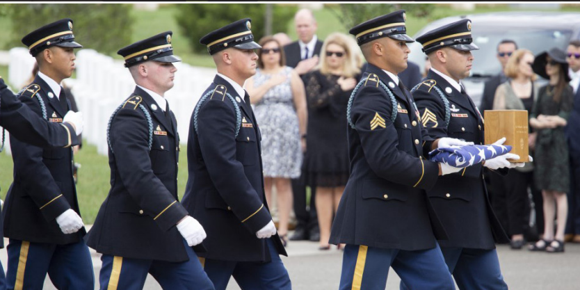
Major Star's memorial service at Arlington National Cemetery

Congress, pressing the need for legislation to help our nation's combat-disabled. These advocacy efforts, both individually and in collaboration with a coalition of other veteran service organizations, have helped garner over 330 co-sponsors for the bill in the House and 66 in the Senate.