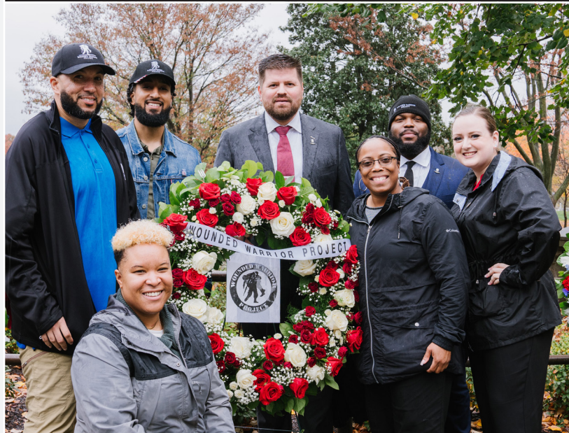
Warriors and WWP teammates attend the ceremony for the 69th annual National Veterans Day Observance at Arlington National Cemetery

On Nov. 11, WWP had the humbling opportunity to participate in Veterans Day commemorations with the nation's leaders and veterans' groups in Washington, D.C.